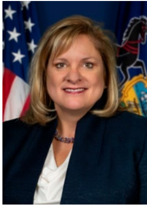
Chair, Communications & Technology Committee Senate of Pennsylvania (R-24)

The traditional Tel-PAC breakfast fundraiser will be held on Tuesday, July 9 th in the Starlight West. ( Breakfast begins at 7:15 AM – Speaker at 8:00 AM ).